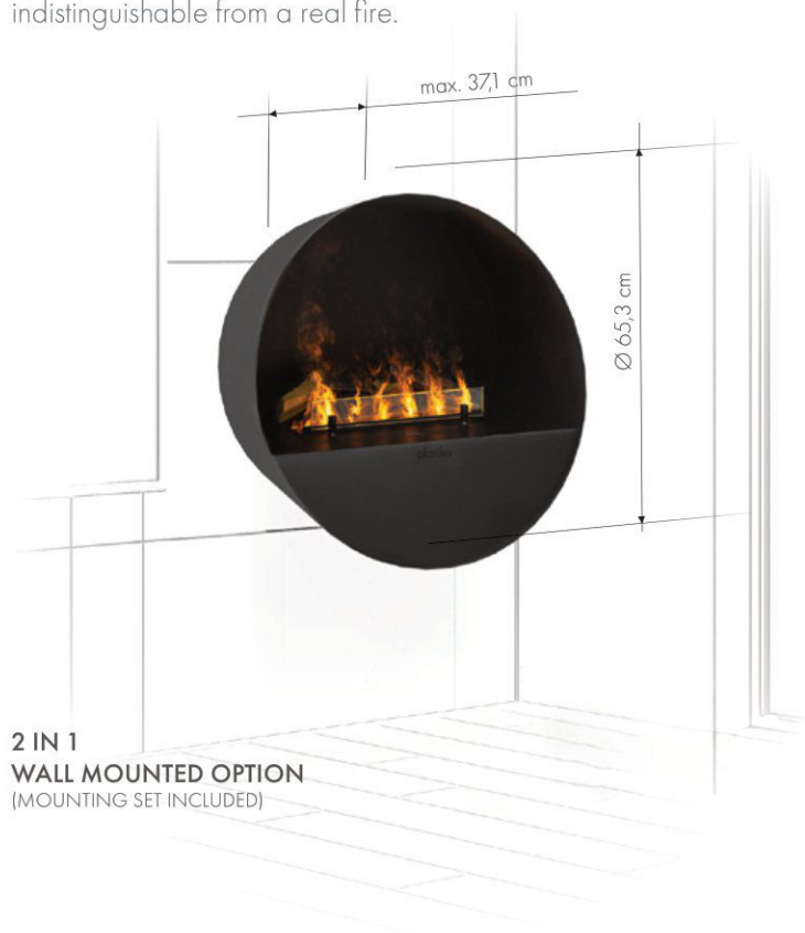
2 IN 1 WALL MOUNTED OPTION (MOUNTING SET INCLUDED)

This technology utilizes ultra-fine water mist and LED lighting to simulate the appearance of real flames. The water mist, produced by a silent ultrasonic atomizer, is illuminated by LED lights, creating a convincing illusion of flames that is almost indistinguishable from a real fire.