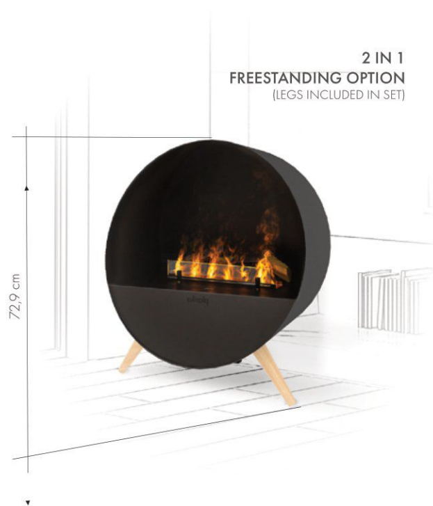
2 IN 1 FREESTANDING OPTION (LEGS INCLUDED IN SET)

Misty combines modern aesthetics with versatile functionality. Its distinctive spherical shape makes it a striking focal point in any room, while its dual wall and floor arrangement options offer flexibility in interior design.